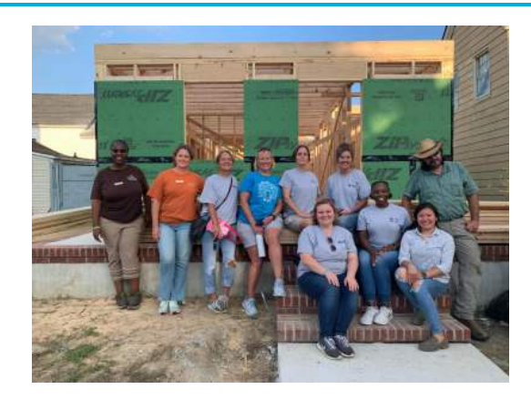
Staff from Habitat Choptank, Pickering Creek, and the Multicultural Center gather for a group photo.

Are you interested in lending a hand on our construction sites? Click this button to become a volunteer!