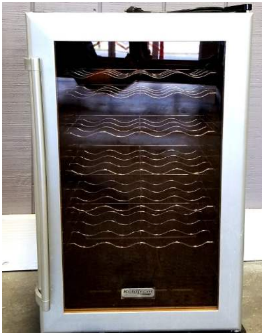
This 28 bottle Koldfront wine cooler is one of the three great items featured in this week's online auction.