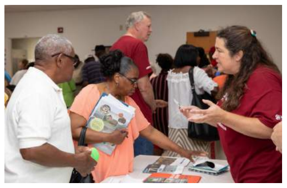
ARP Foundation For a future without senior poverty.

The AARP Foundation's "Here to Stay: Home Upkeep for All" workshop is a part of Habitat for Humanity's national Aging in Place program. Habitat Choptank is one of only three Habitat affiliates nationwide chosen to implement and test the AARP Foundation's pilot "Here to Stay" program.