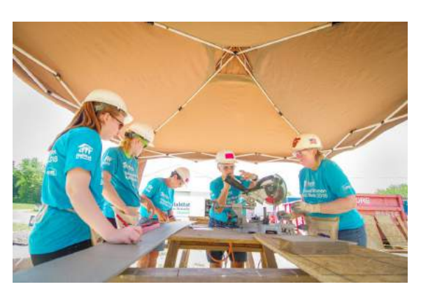
Celebrate the Year of the Woman Women's Build Events March 4th & 7th