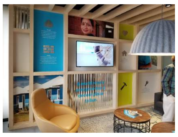
Habitat for Humanity International Headquarters Atlanta, Georgia