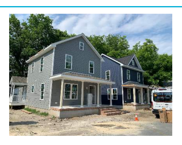
Wells Street in Cambridge will soon be a thriving neighborhood of safe, affordable, and energyefficient homes.

Habitat Choptank is one of 14 affordable housing initiatives in seven states that was awarded funding from the Federal Home Loan Bank of Atlanta (FHLBank Atlanta) in 2022. It is the only project funded in Maryland. This grant will support Habitat Choptank's ambitious project on Wells Street in Cambridge by supporting a portion of the costs associated with constructing eight single-family affordable homes for ownership. BayVanguard Bank, a local bank and member of FHLBank Atlanta partnered with Habitat Choptank, making it possible for the grant application to move forward. BayVanguard Bank is also providing a construction bridge loan to Habitat Choptank to assist in financing the construction costs.